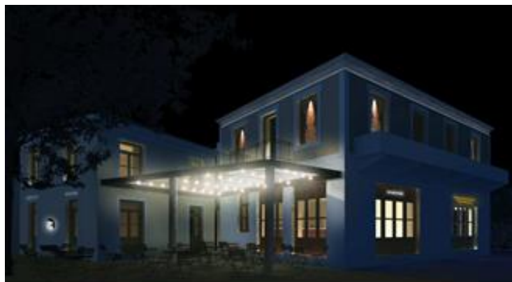
The color paintings are the final ones