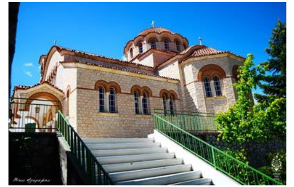
The St Andrew Church