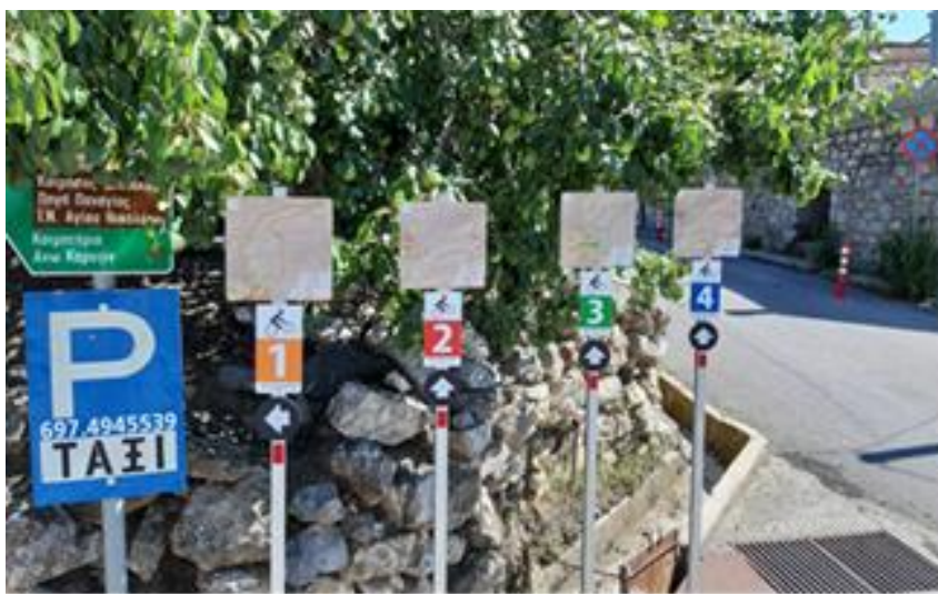
The special cycling signposts

The TERRAIN COMPANY , with funding from the Kerchoulas Trust , has just completed the marking of 4 mountain biking routes , with a total length of 52 km , in the greater area of Karyes, in the most beautiful oak forest of Mount Parnon! According to an announcement of the Company, "with top quality materials, the know-how of TERRAIN that guarantees the durability and functionality of the project, and of course the top design of Olga Kodoni . In the village where races of the Panhellenic Mountain Biking Championship are organized as well as international cycling races, now there is the infrastructure for all cyclists to enjoy a magical cycling experience. Come on!"